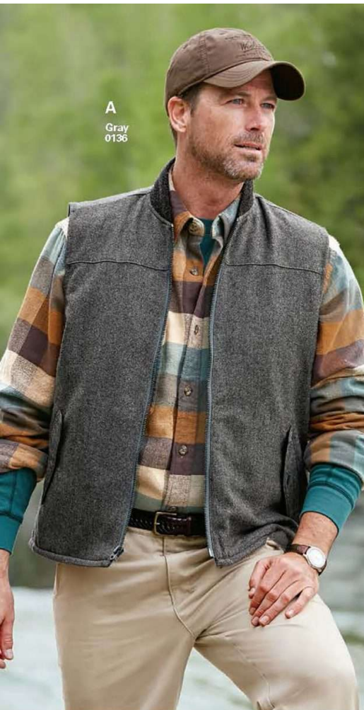
A Gray 0136