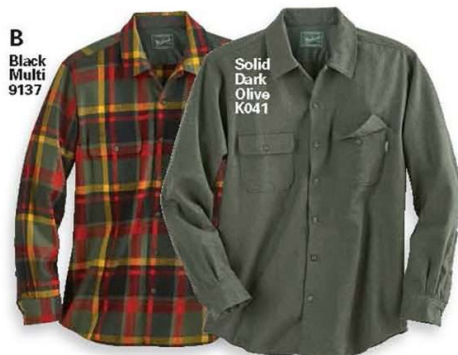
B Black Multi 9137