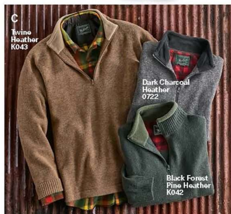
C Twine Heather K043